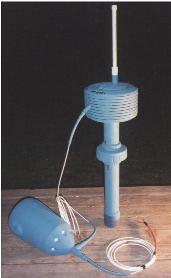
Long duration hull used with deep drogue.

Surface-following Davis/CODE drifter hull, available in two color schemes. High visibility colors help prevent shipstrikes and aid in retrieval, low-visibility colors minimize nuisance pickup of drifters by boaters.