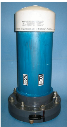
Low profile case

The Brightwaters Model 117 GPS/Argos mooring monitor is a self-contained, self-powered device designed to be attached to the surface buoy of a mooring in a body of water. The monitor determines its location using GPS and compares this location to a stored “anchor watch” position. If the mooring breaks free and begins to drift, the monitor activates a radio transmitter and begins to send the position of the mooring to the end user. This radio telemetry is accomplished using the joint US/France Argos satellite system. Using Argos provides worldwide data collection service and email notification direct to the end user if a mooring breaks free.