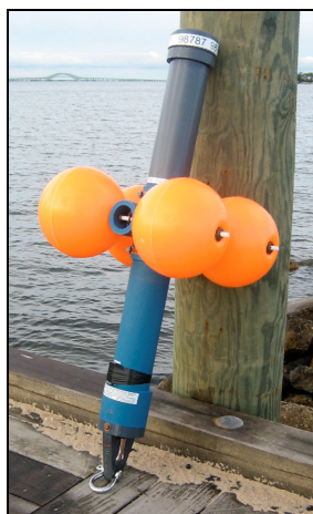
Self - flotation option

Overview. The Brightwaters Model 113C Submersible Argos Beacon is a marker transmitter designed to assist in the location of submerged moorings that come to the surface after intentional release or mishap. The beacon uses a pressure switch transmitter cutoff to shut down the transmitter when submerged.