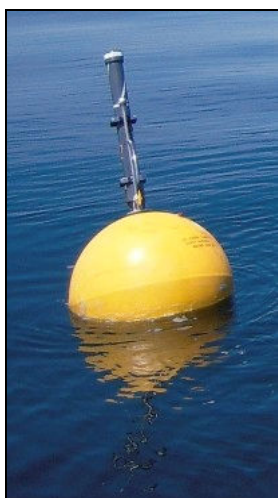
On mooring float